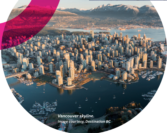
Vancouver skyline.