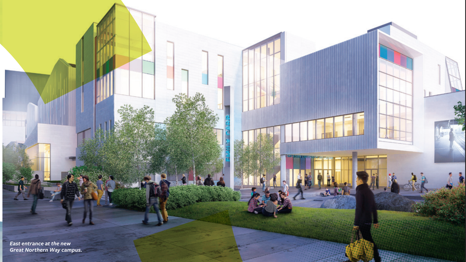
East entrance at the new Great Northern Way campus.