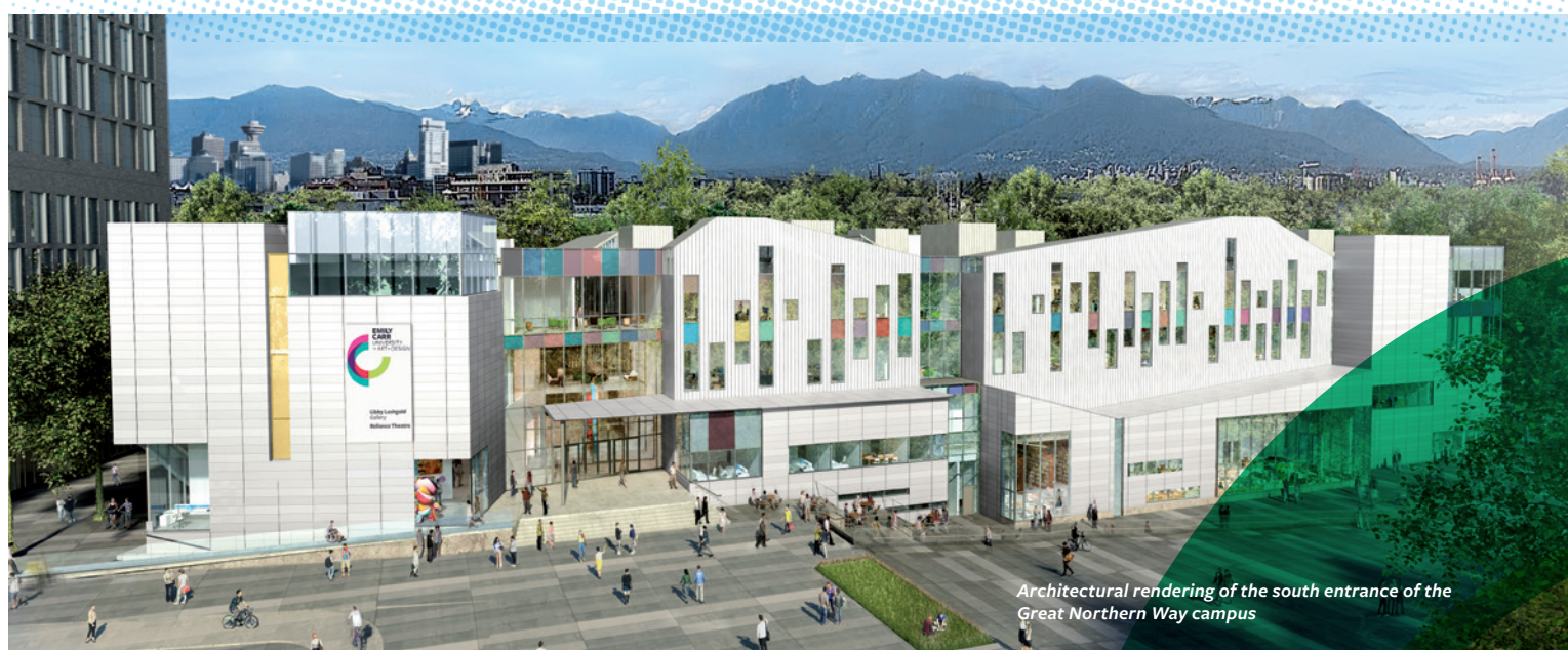
Architectural rendering of the south entrance of the Great Northern Way campus