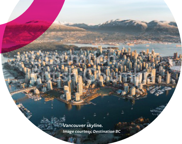
Vancouver skyline.