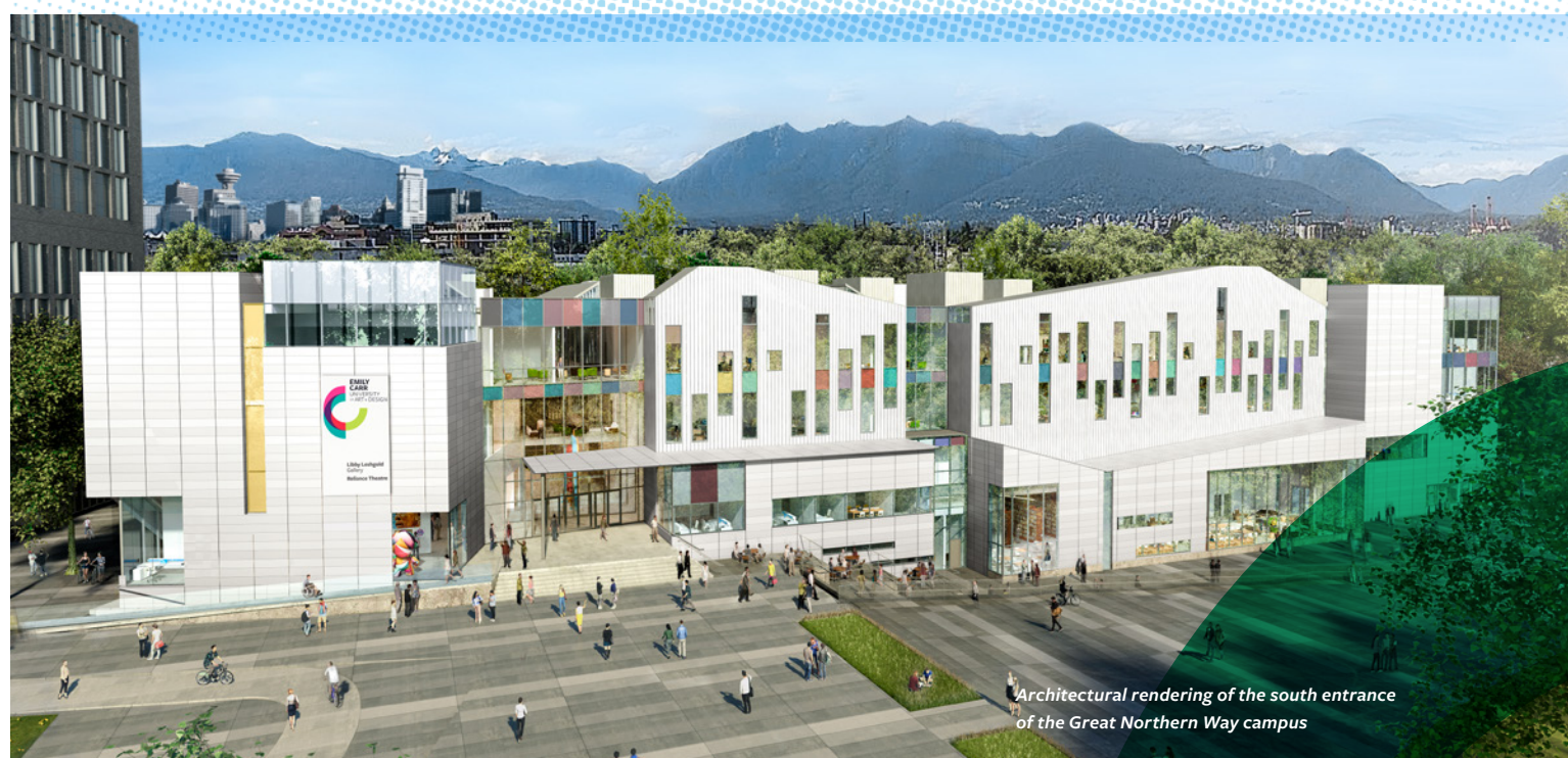
Architectural rendering of the south entrance of the Great Northern Way campus

Emily Carr University of Art + Design takes great pride in our reputation as a global leader in studio-based art, media and design.