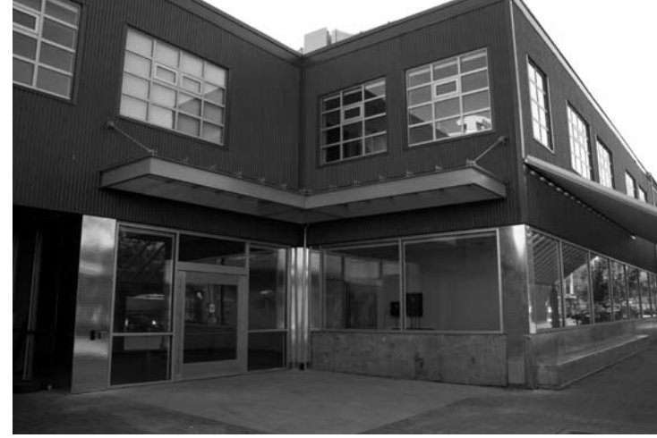
THE NEW IDS FACILITY