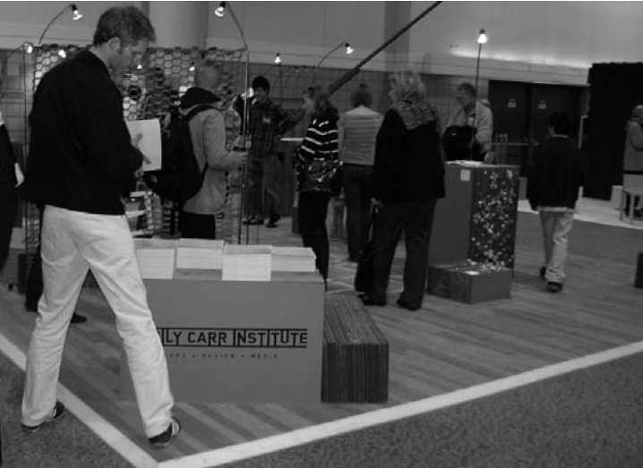
ECI STUDENT BOOTH AT DECORATE VANCOUVER