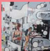
Kiss Kiss oil on acrylic on canvas, 2008 66" x 60"