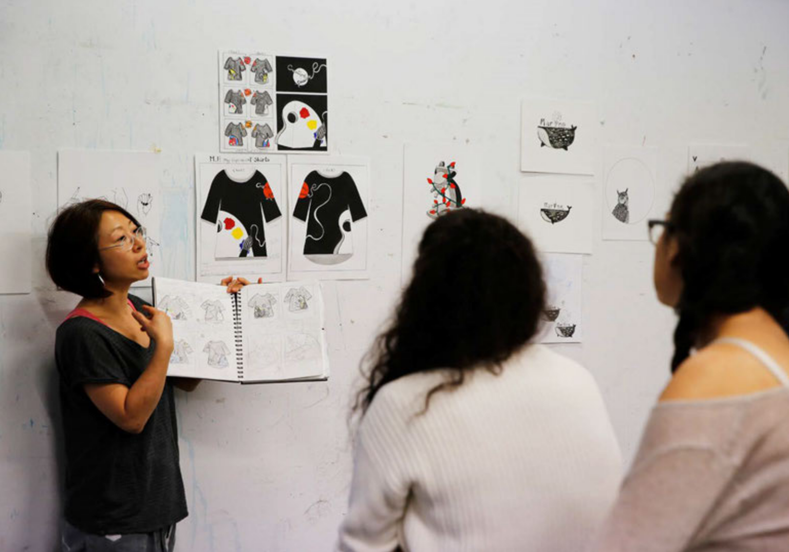
ILLUSTRATION FOR PICTURE BOOKS II

In this intermediate course, you will develop your own written and illustrated 'dummy book', building on concepts such as composition, layout, pacing and character development. Special focus will be placed on the relationship of text and image and the concept of the book as a whole. In-class brainstorming and writing exercises, as well as the analysis of existing works, will help you in writing your own stories. You will have the chance to experiment with paper collage and brush and ink to strengthen composition and color skills in class.