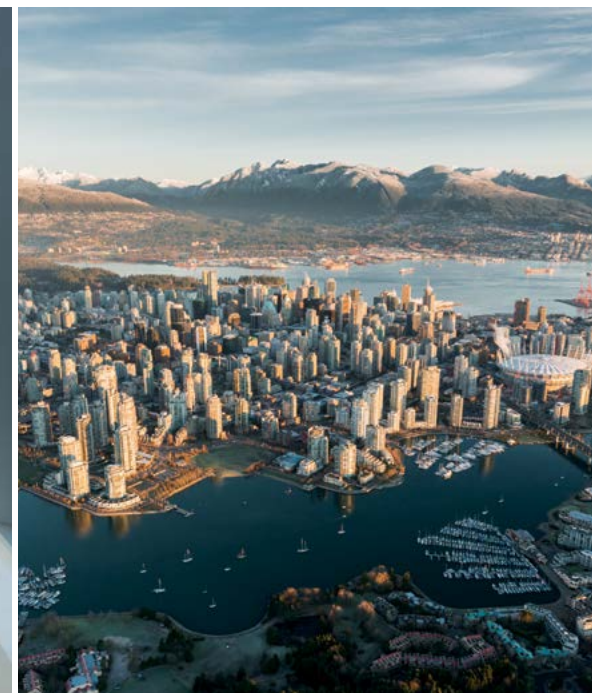
Great Northern Way campus.