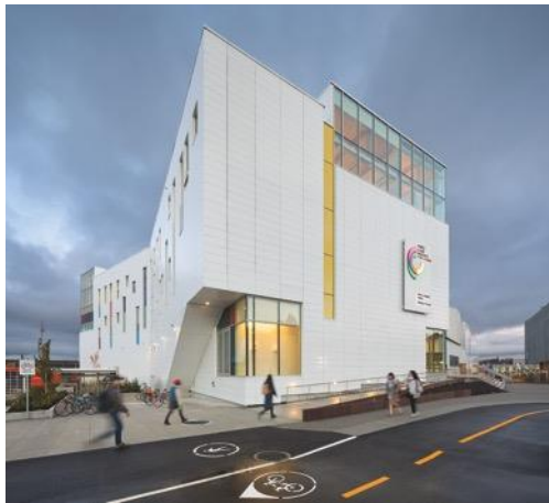
Great Northern Way Campus exterior