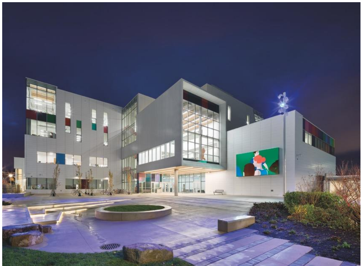
Emily Carr University of Art + Design, Wilson Plaza

For the most recent financial information, please see Emily Carr University's Audited Financial Statements available online at this address .